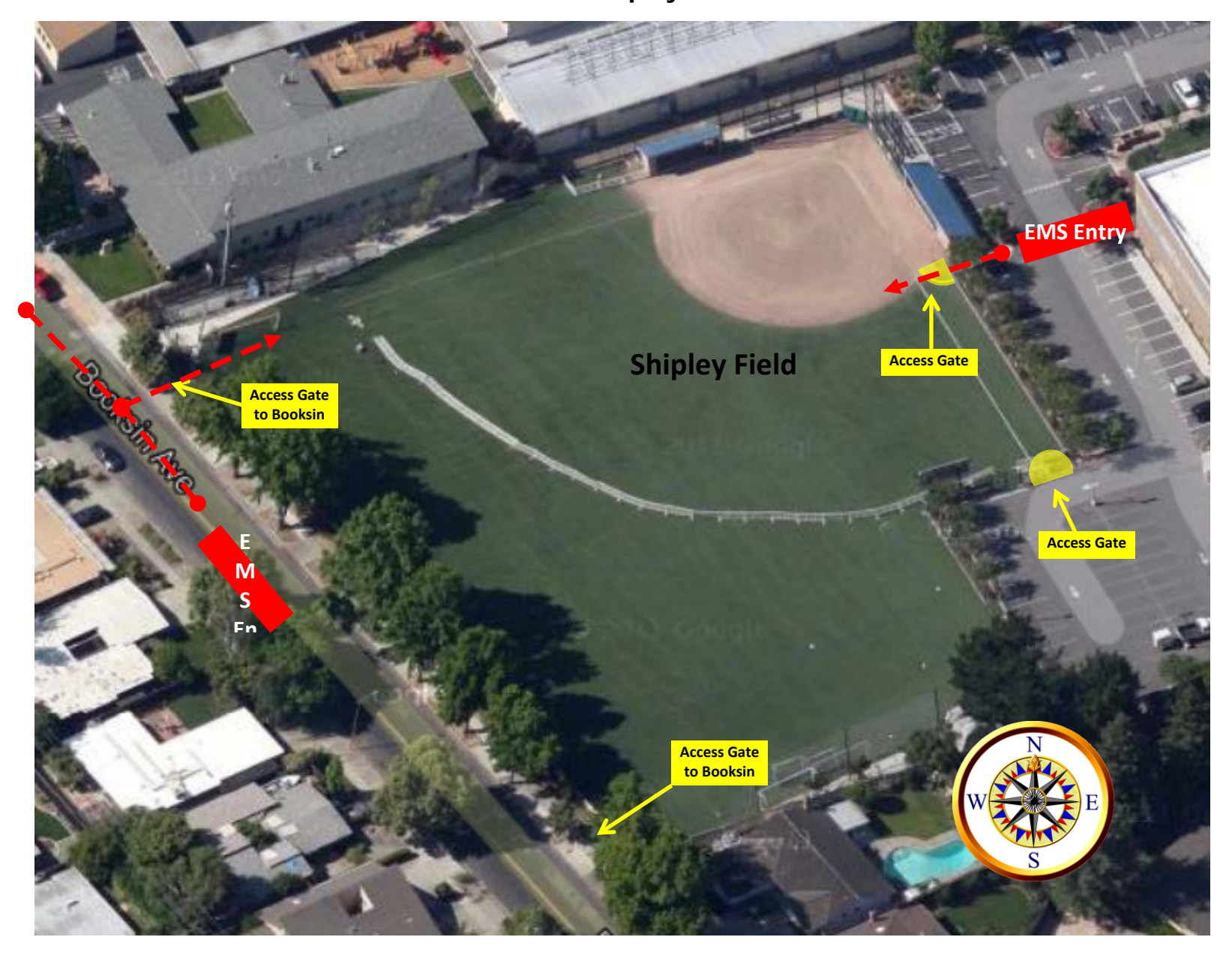
Venue: Shipley Field