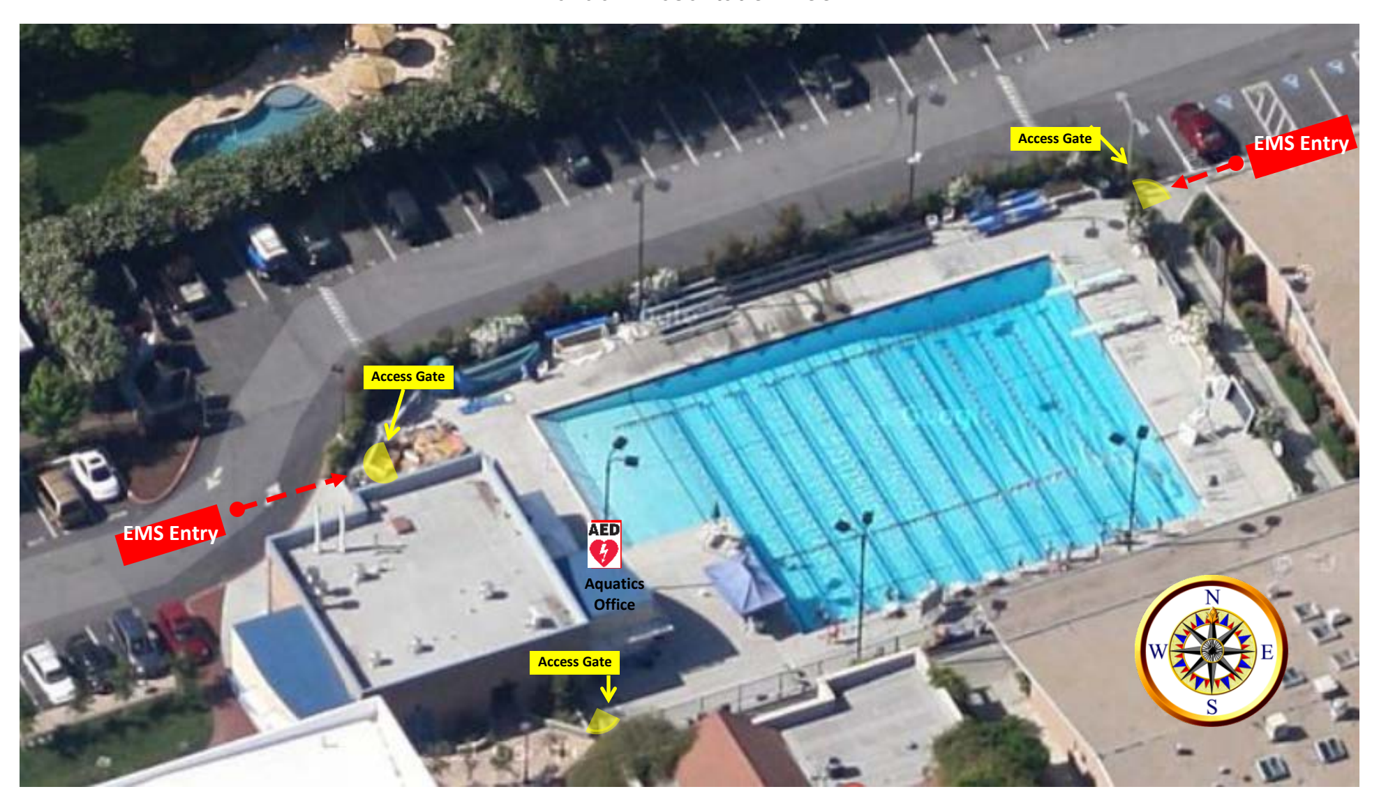
Venue: Presentation Pool