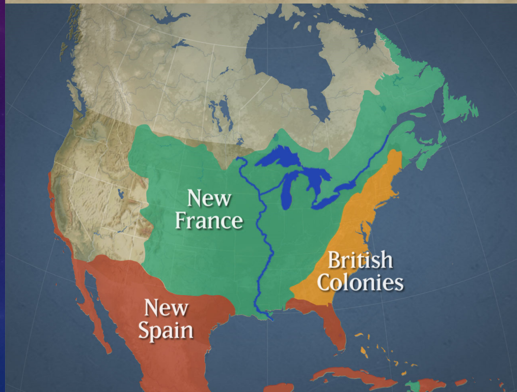
North American, Spanish, French and British Territories circa 1700